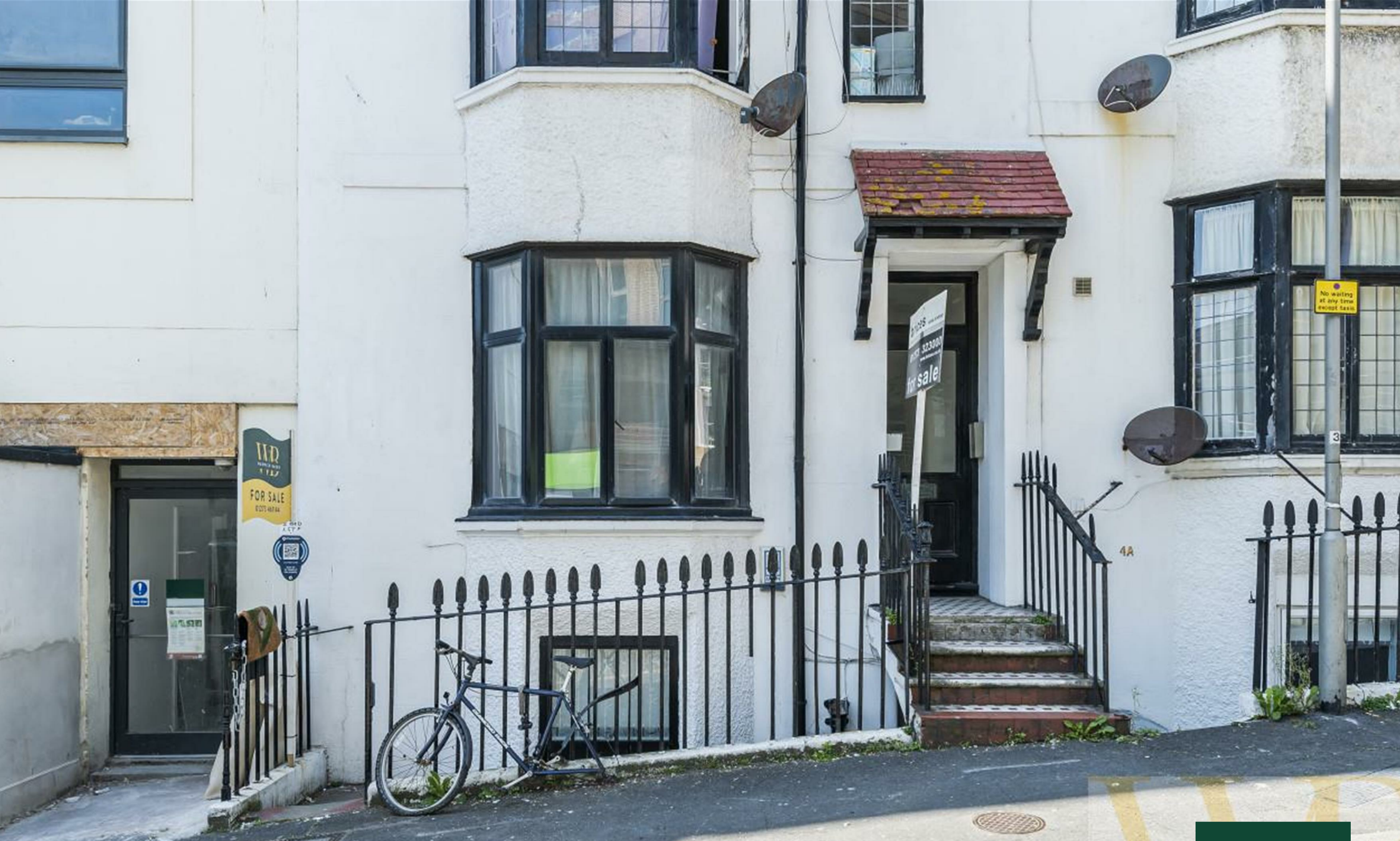
Basement Flat 1 3, Queen Square | | Brighton | BN1 3FD